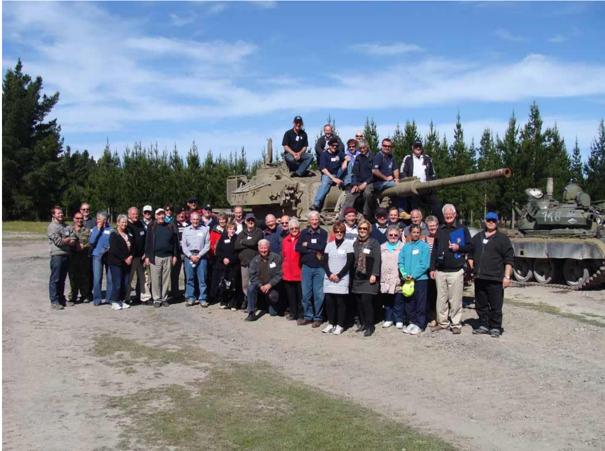
A fine body of men, and women at the RNZAC Association reunion, November 2011

It's also not too late to send your photos, or stories or other material through to the Trust.