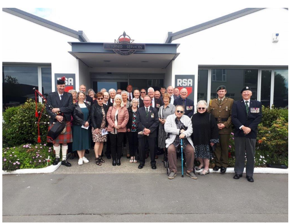
Cambrai 2023 – Minus the Newsletter Editor who managed to skip the photo!!