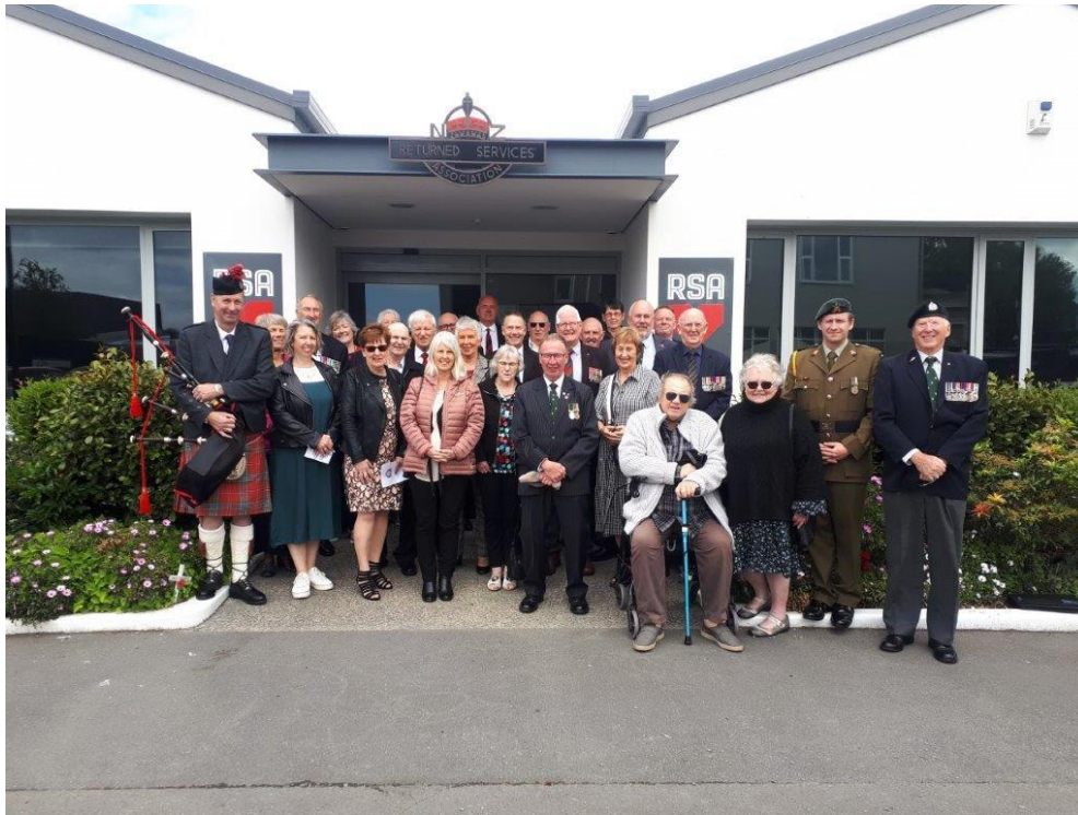
Cambrai 2023 – Minus the Newsletter Editor who managed to skip the photo!!